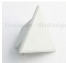
end cap without hole (00084)