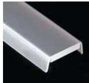
cover type HS frosted (1369) transparent (1370)