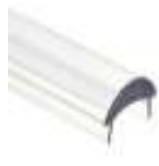
cover type S (00220)