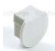
end cap without hole (1439) with hole (1441)