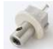
electricity conductive end cap (1435)