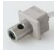
electricity conductive end cap (1407)