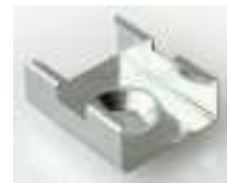
mounting bracket zinc (1072) chrome matt (1345)