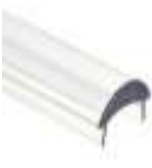
cover type S (00220)