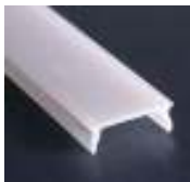
cover type K frosted (1547) transparent (1548)