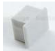
end cap without hole (1055) with hole (1057)