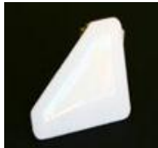
end cap without hole (0959) with hole (1451)