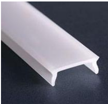
cover type K frosted (1547) transparent (1548)