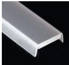
cover type HS frosted (1369) transparent (1370)