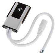
Remote Dimmers & Switches