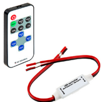
Remote Dimmers & Switches