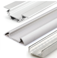
Mounting Hardware & Extrusions